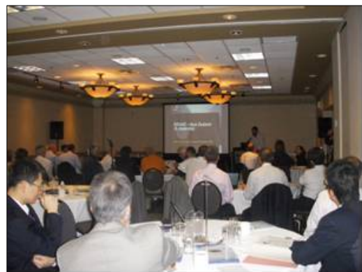
IRCC/WFTAO seminar and workshop

The 14 th Annual Meeting of the World Federation of Technical Assessment Organizations (WFTAO), of which BCJ is a member, was held in Calgary and in Banff, Canada, from September 28 th to October 2 nd , hosted by CCMC (Canadian Construction Materials Center) of NRC (National Research Council Canada). It was attended by 10 member organizations from 10 countries, including BCJ.