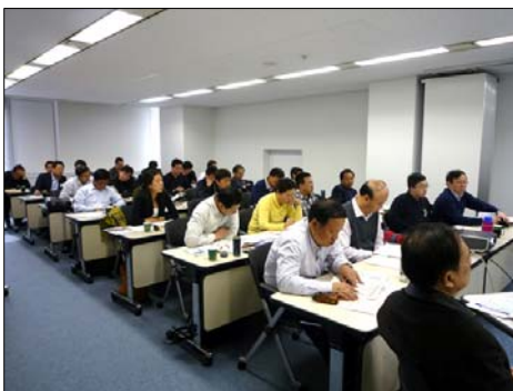
Lecture at BCJ

From November 30 th to December 11 th , BCJ conducted a training course for building administrators from China, under a JICA contract. In China, Japan-China cooperation project that is a 3-year project to spread seismic-resistant buildings has been going on since May, 2009. This course was a part of the cooperation program. BCJ will conduct similar courses in fiscal 2010.