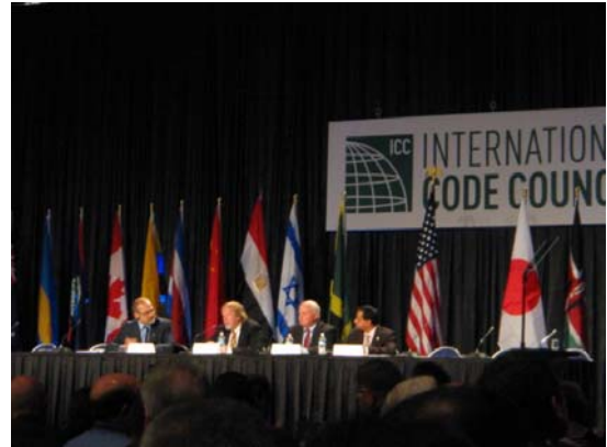
Annual Conference of ICC

The Annual Conference of the International Code Council (ICC) was held in Baltimore, from November 1-8. Three participants from BCJ attended the conference as members of a delegation organized by the Japan Conference of Building Administration (JCBA). The Japanese delegation attended a forum on the making of codes in the United States and an educational program focusing on evaluations. During the international forum, they gave a presentation about Japan's Ministerial Approval System for building materials, and about incidents and countermeasures relating to the falsification of data for fire-resistant materials.