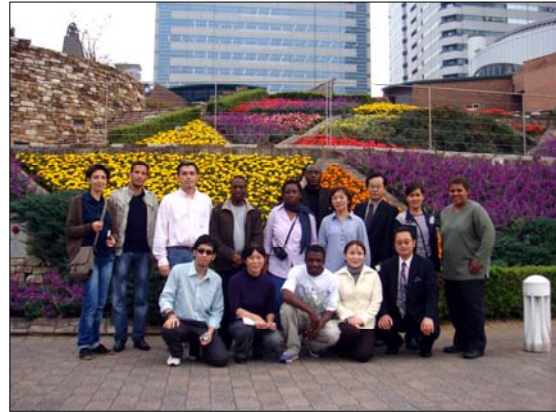
Group photo at Harumi Triton Square

One of the group training courses that BCJ has been entrusted with, “Improvement of Housing and Living Environments”, was conducted from October 22 nd to November 27 th . Eleven people from ten different countries participated in this course. The course was composed of lectures and on-site observations. These were based mainly on themes such as the housing situation and housing policy in Japan; specifically housing