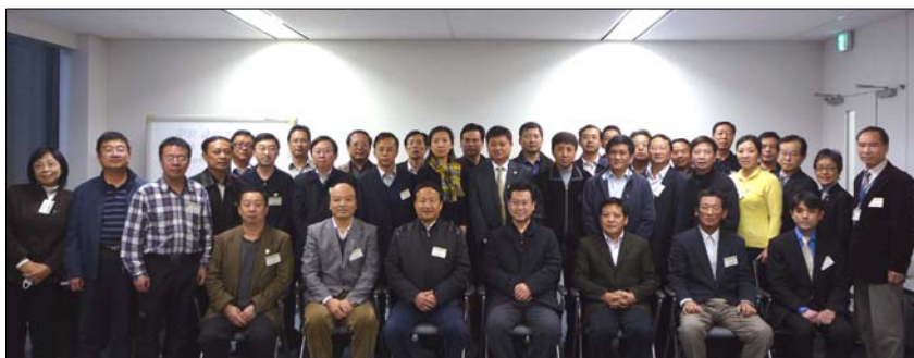
Group photo after the lecture at BCJ

From November 30 th to December 11 th , BCJ conducted a training course for building administrators from China, under a JICA contract. In China, Japan-China cooperation project that is a 3-year project to spread seismic-resistant buildings has been going on since May, 2009. This course was a part of the cooperation program. BCJ will conduct similar courses in fiscal 2010.