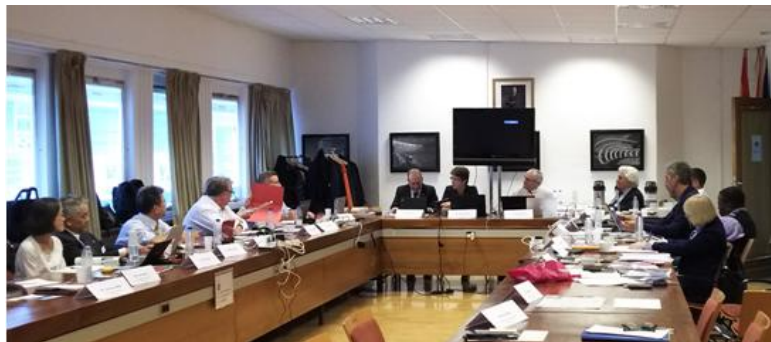
The 21 st WFTAO Annual Meeting in Madrid in 2016

From Oct. 18 to 20, 2016, the 21 st WFTAO annual meeting was held in Madrid, Spain, hosted by IETcc* 4 . Twenty-one people from 11 organizations from 11 countries, including BCJ, participated in the meeting. Reports on recent technical assessment activities were exchanged among the organizations in attendance. Members shared information on the latest issues that respective organizations or countries are facing.