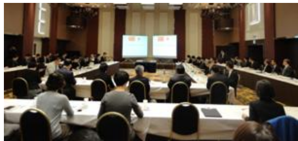
The 7 th Japan-China Meeting on Building and Housing Technology in Tokyo in 2016