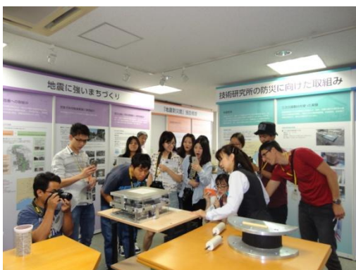
Site visit at UR Technology Research Institute 2016 IYSH Housing Seminar

BCJ was entrusted by the Japan Housing Association to conduct the 2016 IYSH Housing Seminar. The seminar was held from Aug. 29 to Sep. 2, 2016. (14 students from 7 countries and regions: Cambodia, China, Colombia, Mongolia, Myanmar, Nepal, Japan)