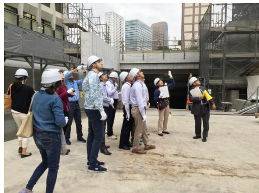
Site visit of high rise building JICA knowledge co-creation program on Improvement and Disaster Prevention of Housing and Living Environments in 2016

*8 JICA: Japan International Cooperation Agency