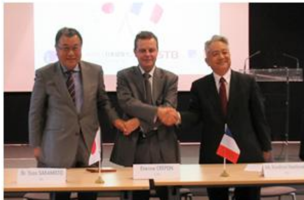
Representatives of three organizations: BRI, CSTB, BCJ: Japan-France Building Colloquium in 2016 (in CSTB Paris office)

Day 3: Joint technical site visit with Japanese and French ministries