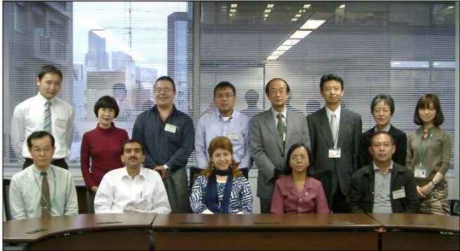
Group photo after a lecture at BCJ

JICA (Japan International Cooperation agency) invites people to Japan from developing countries and conducts group training courses in various fields as part of international technical-collaboration programs. BCJ was entrusted with one of those group training courses: “Building Codes and Control Systems (Building Safety and Social/Environmental