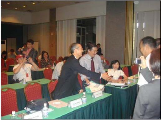
Photo in the seminar room

BCJ shall continue to carry on with the exchange of information-mostly technical-for Mongolian experts as part of the development of our relationship with the Mongolia Center. (In 2006, the Mongolia Center and BCJ signed a memorandum of agreement for the exchange of information in the field of building technologies.)