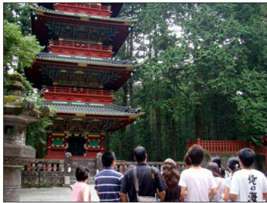
On-site observation (Nikko Toshogu Shrine)

seminar began with presentations and exchanges of opinions on the living environment of each participant's home city. The participants had a full agenda throughout the seminar, with a great variety of lectures and on-site observations on the housing situation and housing policy in Japan, the improvement of crowded city blocks, the redevelopment of coastal areas, a visit to the institute of housing-technology, and preservation of historical cityscapes. They all agreed that they had made a good achievement.