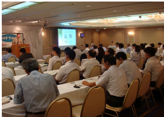
International seminar, Sep. 21, 2011 in Tokyo

The seminar offered a lot of new information and drew great interest from the Japanese audience concerning the approaches of environmentally-friendly building products to building sustainability around the world. Although a big typhoon hit Tokyo on that day, seventy-seven people attended the seminar.