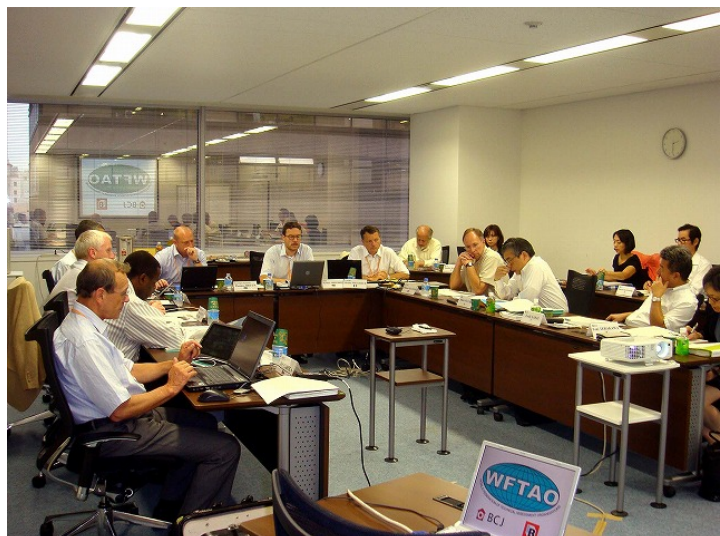
2011 WFTAO Tokyo Meeting at BCJ