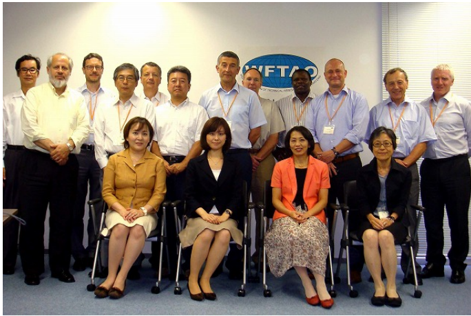
Participants of 2011 WFTAO Tokyo Meeting and the supporting staff of BCJ and CBL

The next meeting will be held in Czech Republic in September 2012.