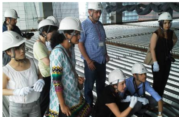
JICA knowledge co-creation program on Disaster Prevention of Buildings in 2015

* 4 JICA: Japan International Cooperation Agency