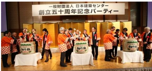
Breaking open a ceremonial sake barrel at the commemorative reception

http://www.bcj.or.jp/en/src/BCJ_50th.pdf