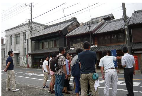
Site visit of Katori City 2015 IYSH Housing Seminar

The program consisted of lectures on the housing situation and the housing policy in Japan, and site-visits to high-density urban areas, the historical-townscape preservation district, public housing and others. The participants also made presentations on what they had learned in the seminar, and discussions were held on each presentation.