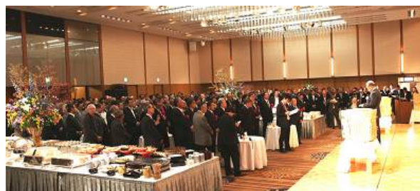
About 500 guests attended the reception.