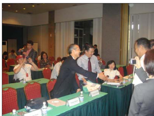
Photo in the seminar room

BCJ shall continue to carry on with the exchange of information-mostly technical-for Mongolian experts as part of the development of our relationship with the Mongolia Center. (In 2006, the Mongolia Center and BCJ signed a memorandum of agreement for the exchange of information in the field of building technologies.)