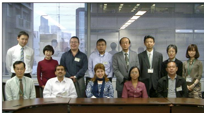
Group photo after a lecture at BCJ

JICA (Japan International Cooperation agency) invites people to Japan from developing countries and conducts group training courses in various fields as part of international technical-collaboration programs. BCJ was entrusted with one of those group training courses: “Building Codes and Control Systems (Building Safety and Social/Environmental