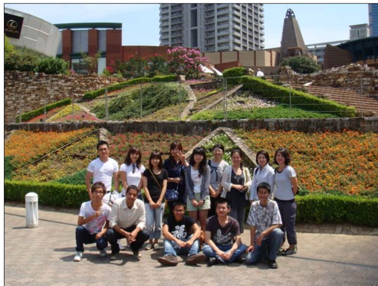
Group photo at Harumi Triton Square

participant's home city. The participants had a full agenda throughout the seminar, with a great variety of lectures and on-site observations on the housing situation and housing policy in Japan, the improvement of crowded city blocks, the redevelopment of coastal areas, a visit to the institute of housing-technology, and preservation of historical cityscapes. They all agreed that they had made a good achievement.