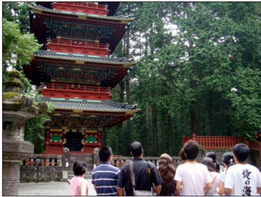
On-site observation (Nikko Toshogu Shrine)

participant's home city. The participants had a full agenda throughout the seminar, with a great variety of lectures and on-site observations on the housing situation and housing policy in Japan, the improvement of crowded city blocks, the redevelopment of coastal areas, a visit to the institute of housing-technology, and preservation of historical cityscapes. They all agreed that they had made a good achievement.