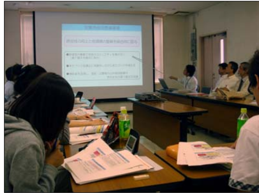
Lecture (Adachi Ward)

The Japan Housing Association holds an 8-day seminar every year, supported by funds from the IYSH (International Year of Shelter for the Homeless) memorial foundation. BCJ is entrusted by the Japan Housing Association with the operations of the seminar and conducted this year's event from Aug. 18 to Aug. 25. This fiscal year, 13 foreign students from six different countries and one Japanese student participated in the seminar. The seminar began with presentations and exchanges of opinions on the living environment of each