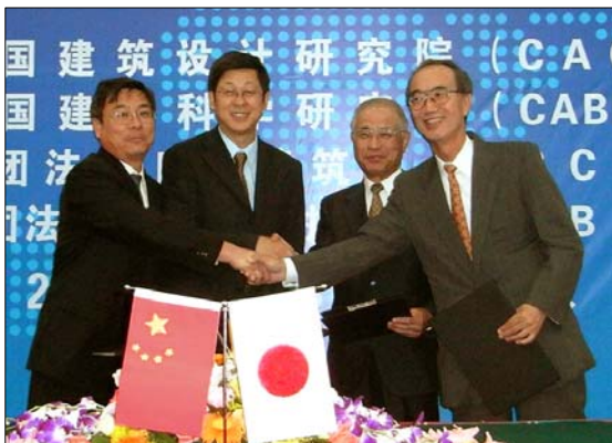
Representatives from the four organizations

Each organization reported on its recent activities and on various issues such as energy efficiency, environmental and seismic technologies in the building and housing