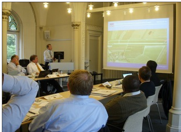
The 15 th WFTAO meeting at ETA Denmark

Update reports concerning recent activities of the respective organizations were exchanged and the participants were able to share their experiences and their solutions to problems. BCJ gave an update report and introduced Japanese efforts for global-warming countermeasures in the building and the housing sectors. These were followed by discussions on how to stimulate WFTAO activities and how to maintain sustainability of buildings in business.