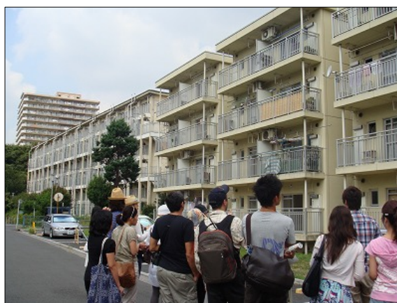
On-site observation of the 23 rd IYSH Housing Seminar (Publicly-Operated Housing)

The Japan Housing Association holds a seminar every year, supported by funds from the IYSH 11 memorial foundation. BCJ is entrusted by the Japan Housing Association with the operations of the seminar and conducted this year's event on 23-27, August. Thirteen foreign students and one trainee from seven different countries and one region participated in the seminar. The participants had a full agenda throughout the seminar, with a great variety of lectures and on-site observations, including the housing situation and housing policy in Japan, the