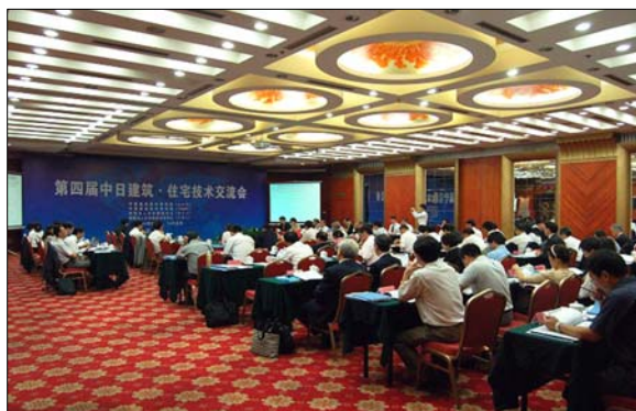
The 4 th Japan-China meeting in Beijing

BCJ and CAG 1 have been meeting regularly since 1985. CBL 2 and CABR 3 have been involved in the meetings since 2004, when the first meeting was held by the four organizations. The organizations regularly exchange a wide variety of information.